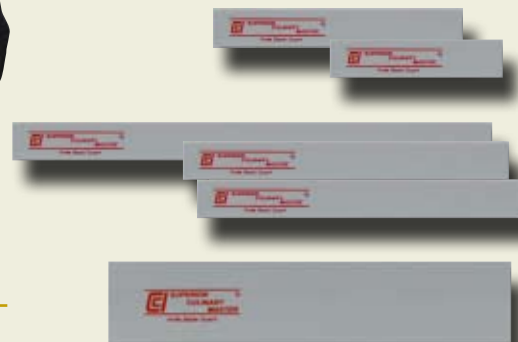
Assorted Knife Blade Guards to fit above product