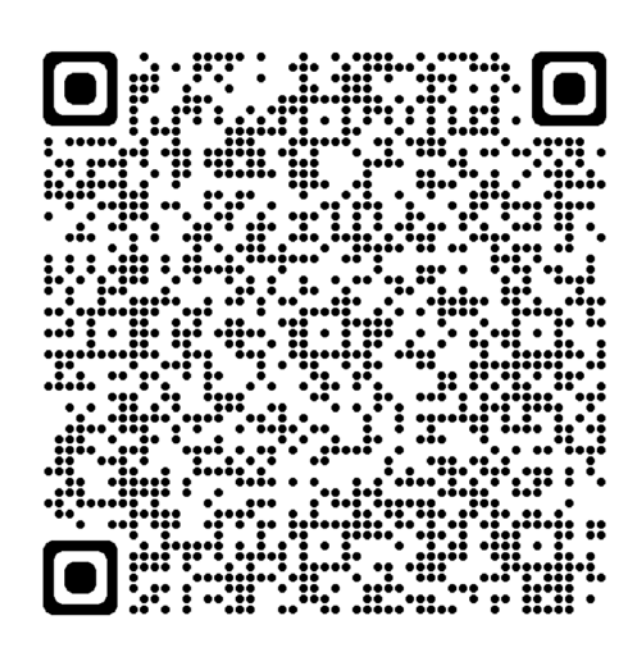
Scan QR Code to submit grades/schedules